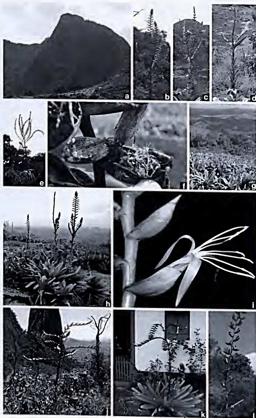
Figure 3 a-l – a-i. Alcantarea trepida – a. habitat at Baixo Guandu; b-d. variation in inflorescence size; e. dead individual with opened capsules and upright branches; f. seeds germinating inside the capsule; g. population at Nova Venécia; h. flowering individuals with both compound and simple inflorescences; i. detail of flower at anthesis. j. Alcantarea extensa at Cachoeiro do Itapemirim, pico de Itabira (type locality), showing patent flowering branches. k. Alcantarea vinicolor under cultivation, showing arcuate branches. l. Alcantarea simplicisticha , detail of the base of an old fruiting spike where the flexuous rachilla and the erect and short peduncle bracts can be seen (arrow). (a-g Versieux 394, 395, 396; h-i Fraga 1920, j Versieux 380, k Versieux 384. l cultivated at the Jardim Botânico do Rio de Janeiro.).